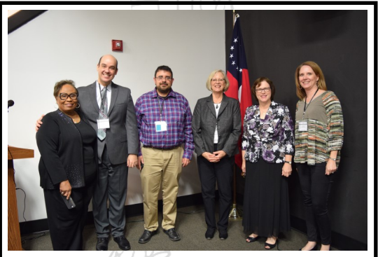
GMTA Executive Board at the 2022 Conference Banquet

of musicianship displayed by our students and teachers never ceases to amaze me.