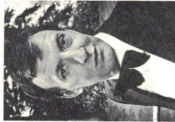
Richard Rodney Bennett